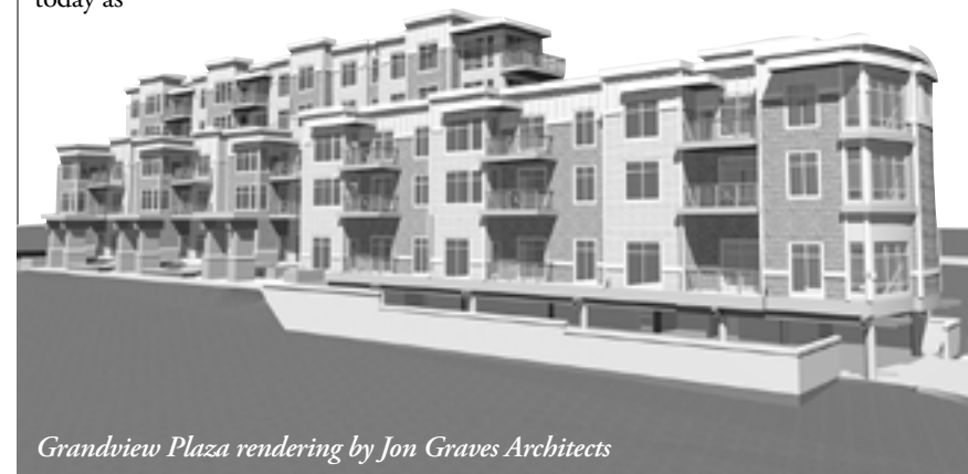
Grandview Plaza rendering by Jon Graves Architects